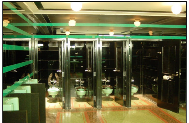
2 Men's Room at the Hermitage Hotel

Downtown Walking Tour (optional): The tour will leave from the hotel for downtown at 1 pm. Our principal guide will be the Curator of the State Capitol building, who will provide insights into the oldest working state capitol building in the U.S. as well as the Egyptian Revival Downtown Presbyterian Church (a National Landmark with a high “WOW” factor (he’s also on the church vestry ). Along the way between the two we will see a variety of sights – including the Legislative Plaza and War Memorial Building, the award-winning Art Deco Men’s Room (2) in the Hermitage