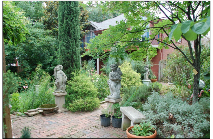
4 My office and the garden in Historic Germantown

In the nearby Historic Germantown neighborhood we will gather at our house and my office (4) to view my collection. Plans include heavy “grazing” (probably enough to call dinner) and drinks. The selections will be from our neighborhood restaurants. Dinner options are also possible, as there are 9 restaurants nearby (most require reservations, info will be available). Please bring two or three special buildings with you to show off - because at some point we will do “show and tell” and we all enjoy showing off our interesting finds.