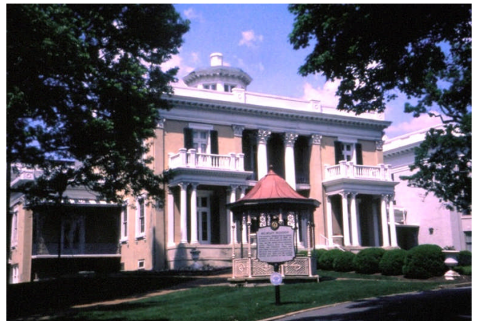
6 Belmont Mansion

Lunch will be on your own, even if you are on the afternoon tour.