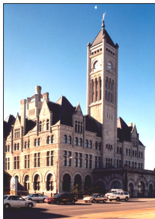
9 Union Station Hotel

Belle Meade Plantation – www.bellemeadeplantation.com