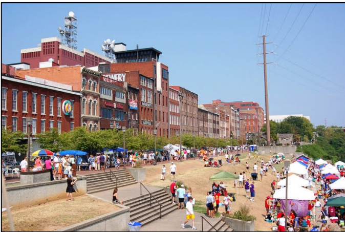
3 Downtown's Riverfront Park

Hotel, the Arcade and what ever else is on our path down to the Market Street and Lower Broadway Historic Districts (7) and their “Honky-Tonks”.