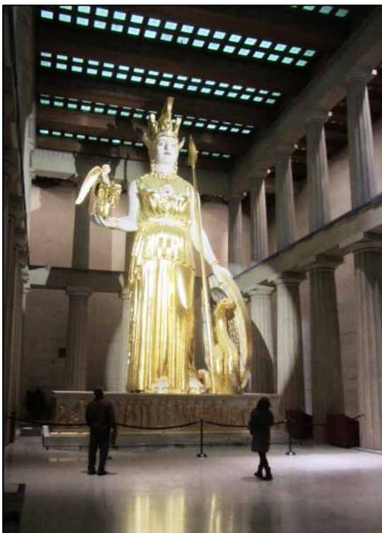
5 Athena Partheneos at the Parthenon